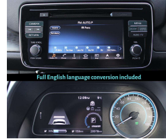
Full English language conversion included