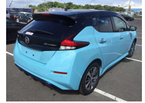
Drive EV Battery & High Voltage System Warranty