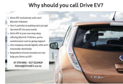
Why should you call Drive EV?